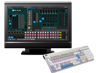
KRR-LIC-1ME-GUI provides a software and keyboard option for controlling Karrera.